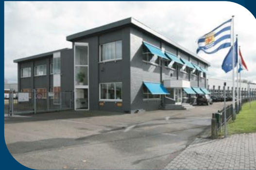
Decade of the 80's

Interjute was founded in March 1958 in Holland, as a supplier of reused jute bags. This business vision, favored by the good economic times that benefited the increase in exports, soon turned Interjute into one of the largest suppliers in Europe.